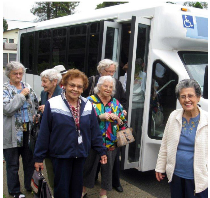
Seniors boarding the Delta Seniors Bus

The Delta Seniors Bus is the only municipally funded and operated seniors' transportation service in Metro Vancouver. From the perspective of City staff, the service is successful in enabling older adults in the community to remain independent, active, and socially connected; and in relieving some of the pressure on families and friends to provide transportation. Riders are generally happy with the booking process and appreciate booking with a live dispatcher rather than an automated service.