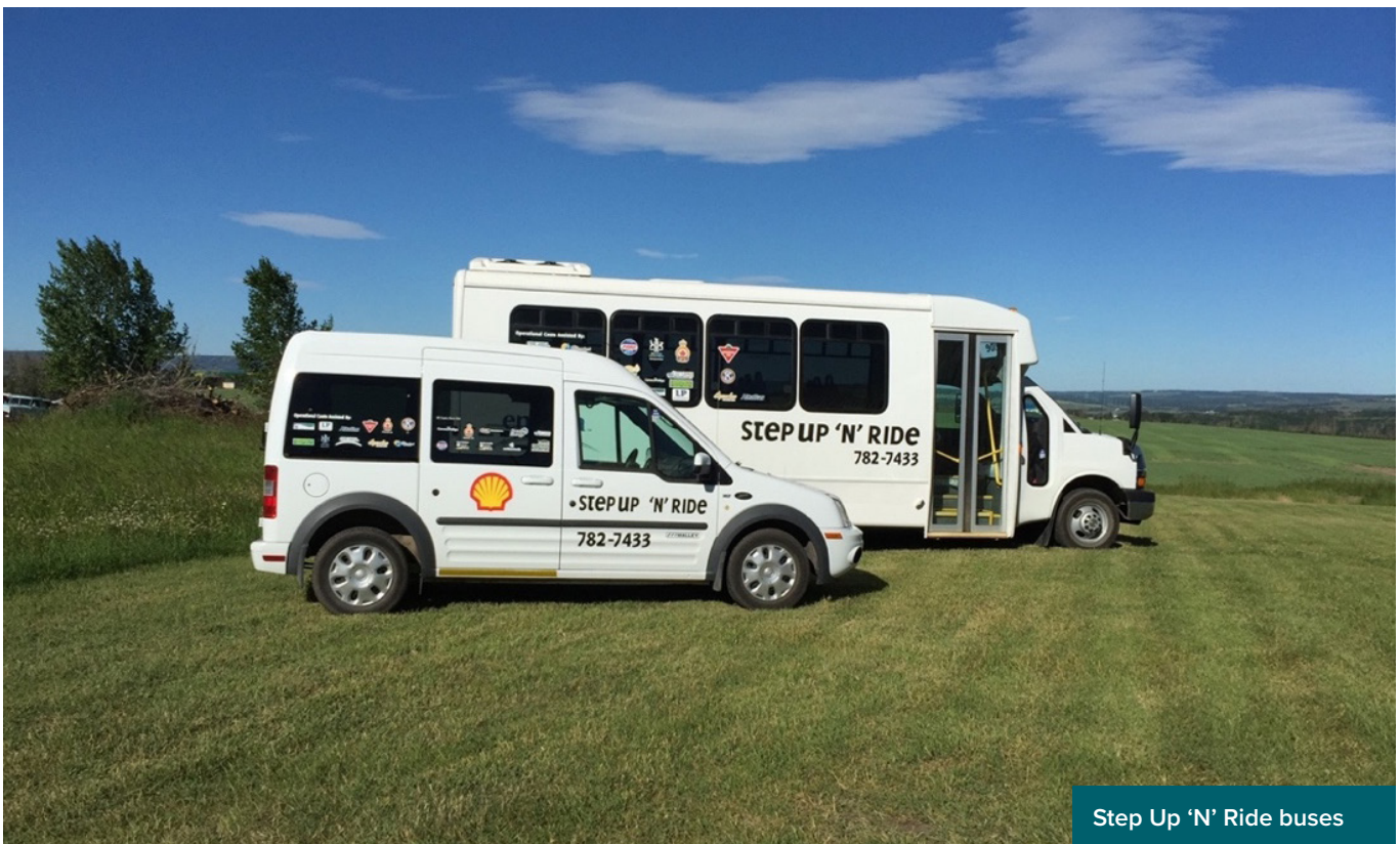
Step Up 'N' Ride buses