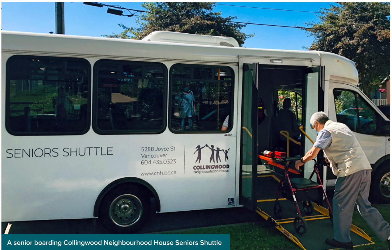
A senior boarding Collingwood Neighbourhood House Seniors Shuttle