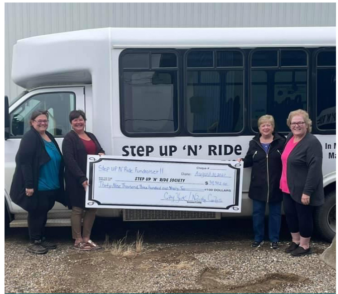
Dawson Creek residents organized an auction to raise funds so that Step Up N' Ride could continue to operate in August 2021

The main challenge for Step Up 'N' Ride is securing core funding. The City of Dawson Creek and the Regional District collectively contribute annual funding that covers about a sixth of Step Up 'N' Ride's annual operating costs. The rest is fundraised through grants and donations. Core funding for Step Up 'N' Ride would alleviate the burden of fundraising and help sustain the service when the manager moves on from the role. A second challenge for Step Up 'N' Ride is finding suitable drivers for the job. Drivers must be able to work with a range of personalities and abilities. Step Up 'N' Ride has had excellent drivers, but when one leaves, it can be a challenge to find a replacement.