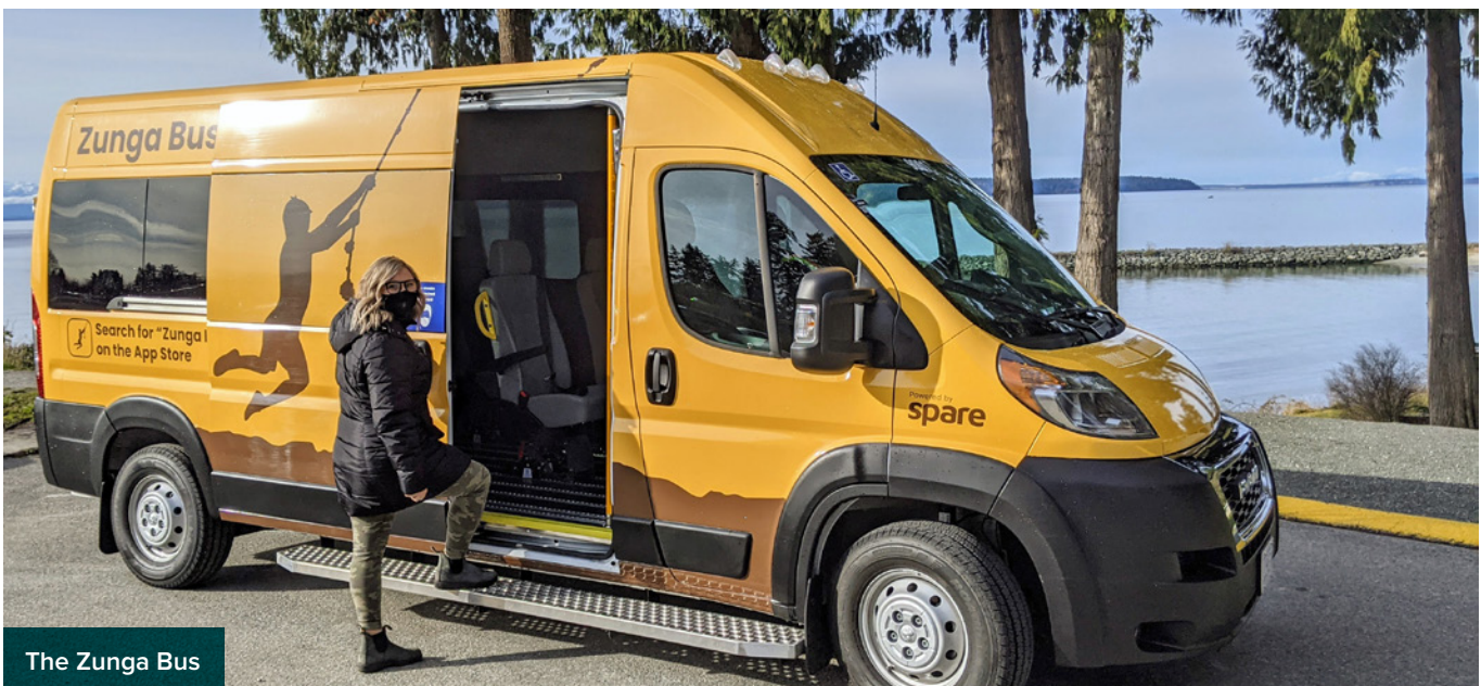
The Zunga Bus